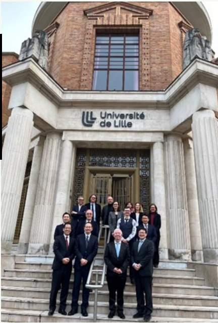
The University of Lille