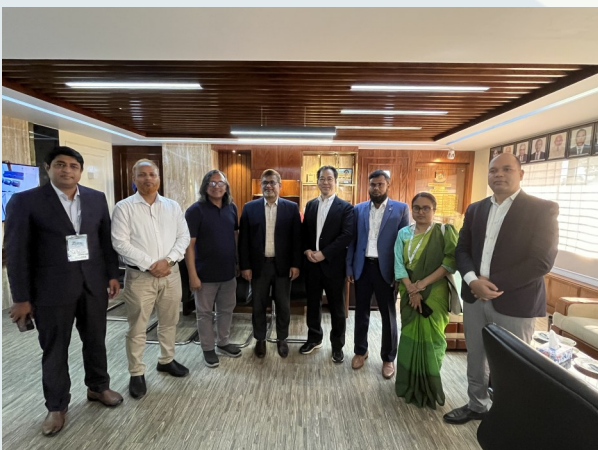
Sher-e Bangla Agricultural University