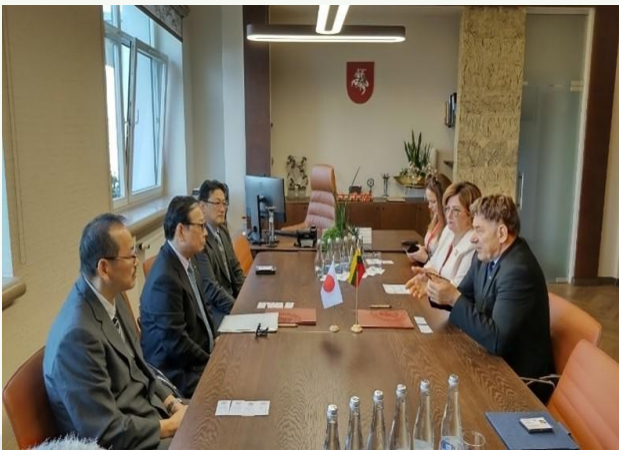
Vytautas Magnus University